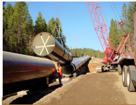
78" Welded Steel Pipe Installation

The PacifiCorp Prospect Hydroelectric Project is located in Jackson County, Oregon, on the Rogue River and on two tributaries approximately 45 miles northeast of Medford, Oregon, near the town of Prospect. Lands abutting the project include those owned by the U.S. Forest Service, state of Oregon, Boise Cascade, PacifiCorp, and other private landowners.