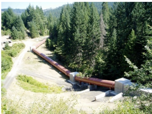
Completed Above-Ground 78" Welded Steel Pipeline

Original construction took place between 1911 and 1946 by the California–Oregon Power Company (Copco). Copco subsequently merged with Pacific Power and Light Company in 1961. Since then, the project has been owned and managed by PacifiCorp with additional phases added. It includes three concrete diversion dams, three powerhouses, and a water conveyance system of approximately 9.3 miles. The entire hydroelectric system is a run-of-the-river operation.