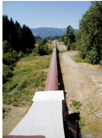
Penstock Pipe Heading to the Powerhouse

*Please ask for a copy of our independent testing performed by The Utah Water Research Laboratory - "Friction Test on 48" Polyurethane-Lined Steel Pipe" - May 2007